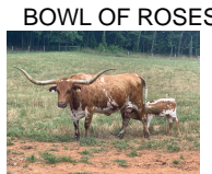
BOWL OF ROSES