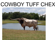
COWBOY TUFF CHEX