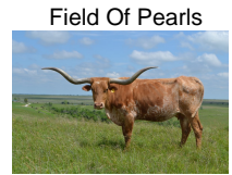
Field Of Pearls