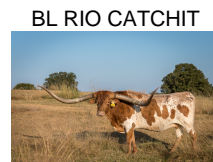
BL RIO CATCHIT