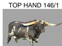
TOP HAND 146/1