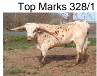
Top Marks 328/1