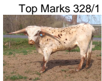
Top Marks 328/1